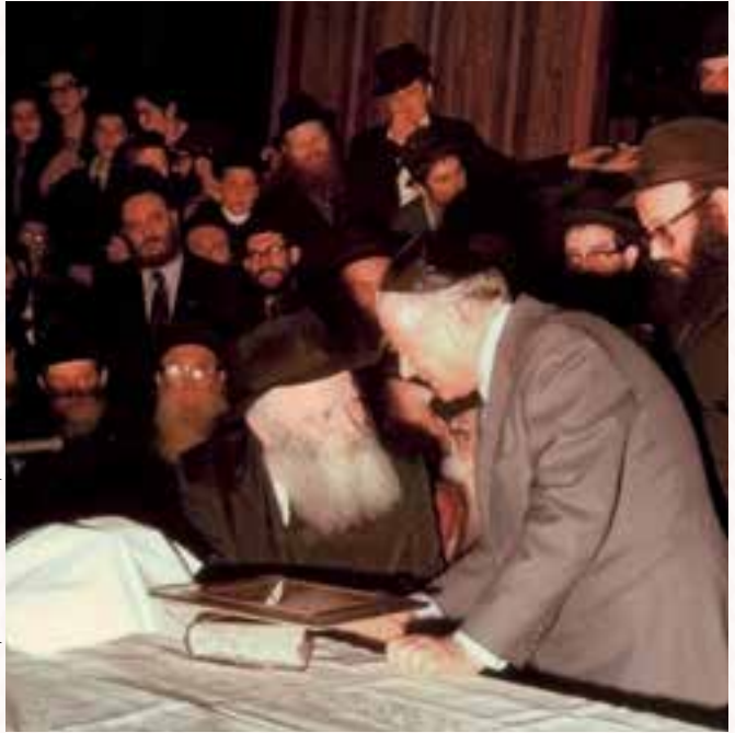
THE REBBE SPEAKS TO NY MAYOR ABRAHAM BEAME.

"It must be behind closed doors. I hold of quiet diplomacy. It is always this way with