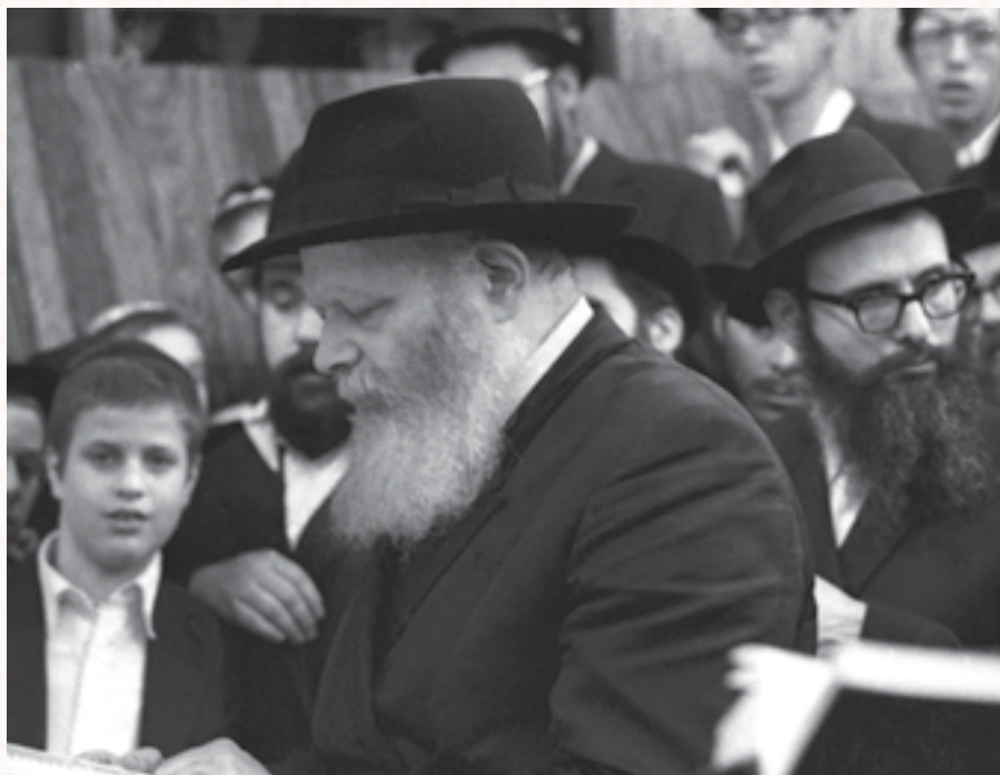
THE REBBE DAVENS AT THE AMUD FOR MAARIV.

the Rebbe Shlita would be officiating and davening Maariv. The Yud Shevat Farbrengen would take place on the following evening, Wednesday. We rushed to ‘770’ expecting to find a large crowd of people, but not such a crowd. The service had to be held in the large Shul, and a typical Yom Tov scene met our eyes. There were literally many thousands of people present and the place was absolutely packed. Even the women’s Shul was full to overflowing...”