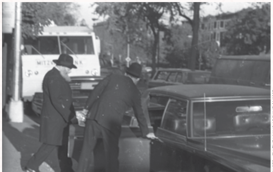
THE REBBE ENTERS THE CAR AS A MITZVAH-TANK STANDS BY.