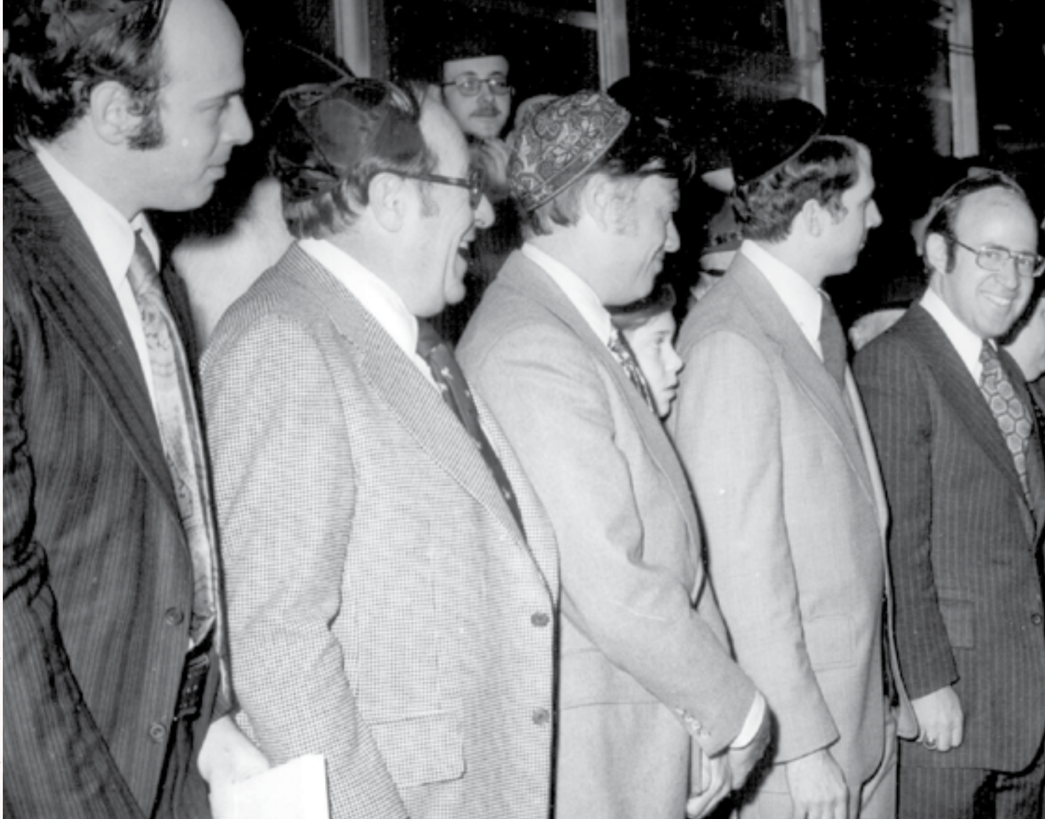
THE REBBE GREETES DIGNITARIES AND POLITICIANS AS HE ENTERS THE FARBRENGEN.